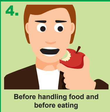
Before handling food and before eating