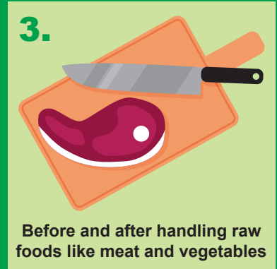
Before and after handling raw foods like meat and vegetables