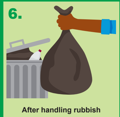
After handling rubbish