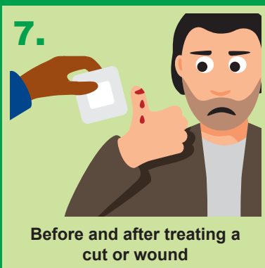
Before and after treating a cut or wound