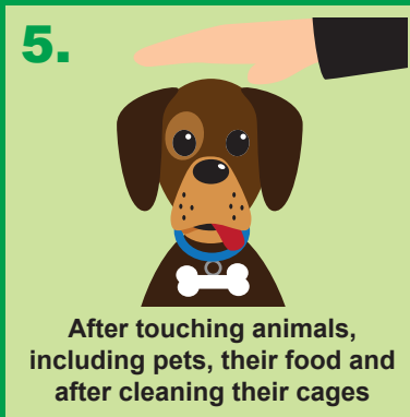
After touching animals, including pets, their food and after cleaning their cages