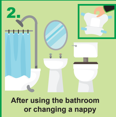
After using the bathroom or changing a nappy