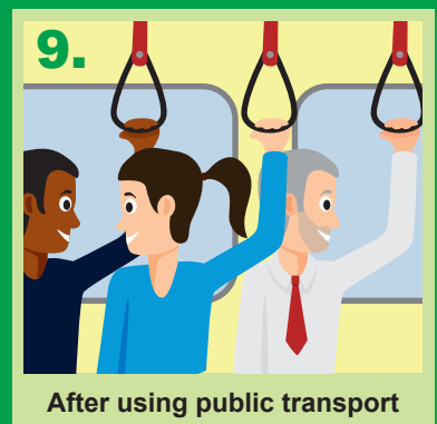
After using public transport