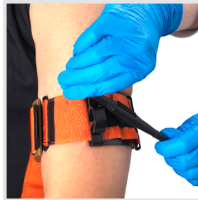
Apply tourniquet above the injured area.