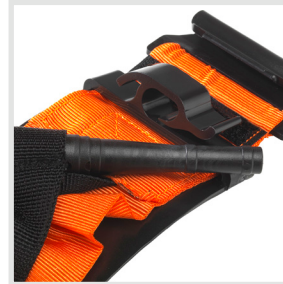
Twist windlass and secure under locking hook.