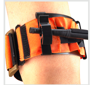
Keep tourniquet in place until emergency services arrive.